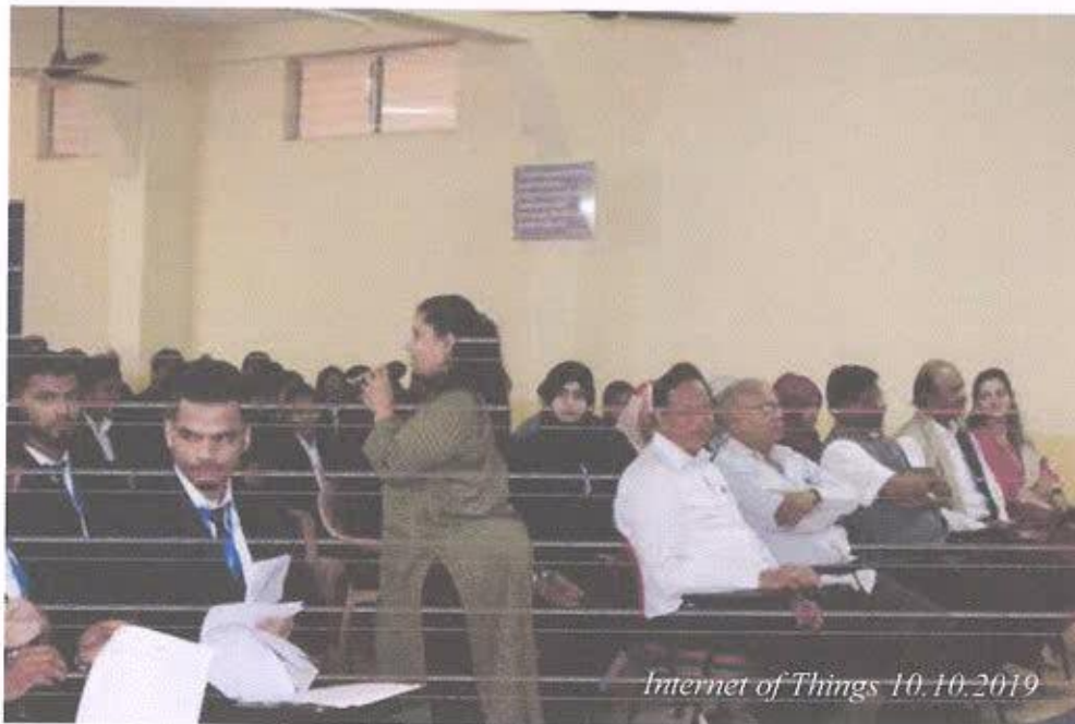
Internet of Things 10.10.2019

ICS College were organized program on Internet of Things for students. This program was jointly organized by Department of BMS on dated 10.10.2019. This program was conducted offline mode.