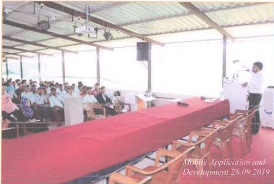
Mobile Application and Development 28.09.2019

ICS College were organized program on Mobile Application and Development for students. This program was jointly organized by Department of CS on dated 28.09.2019. This program was conducted offline mode.