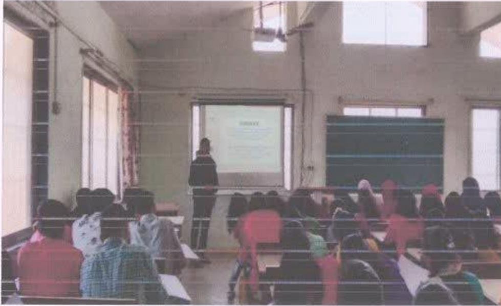
Environment awareness seminar

Briefing Activity - student S.P. Hegshetye College of Art's, Commerce and Science, Ratnagiri were attended a seminar in Shrimati Indira Mahadev Beharey College of Arts, Shriman Chandulal Sheth College of Commerce & Shrimati Shobhanatai Chandulal Sheth College of Science, Khed. Dist. Ranagiri, Maharashtra On Environment awareness