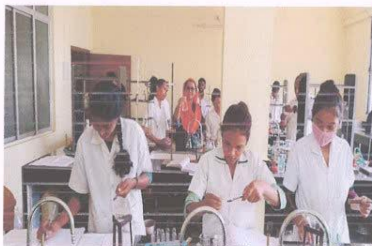
Students are working in Lab at Dapoli Urban senior Science College,

Briefing Activity - Student from Shrimati Indira Mahadev Beharey College of arts, Shriman Chandulal Sheth College of commerce & Shrimati Shobhanatai Chandulal Sheth College of Science khed. Dist. ratnagiri, Maharashtra were attended a laboratory work in Dapoli Urban senior Science College, Dapoli. Tq. Dapoli. Dist.- Ratnagiri. for new technique and method of green synthesis to minimize the pollution caused by the chemical reaction. Students are also aware of some new methods of green synthesis.