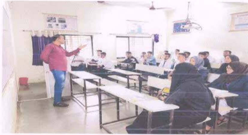
Student at Vishwabhusan Bhartratna Dr. Babasaheb Ambedkar College at vidynagari. Post Amadave. Tq. Mandangad, dist. Ratnagiri.

Briefing Activity- In student exchange activity student from Shrimati Indira Mahadev Beharey College of Arts, Shriman Chandulal Sheth College of Commerce & Shrimati Shobhanatai Chandulal Sheth College of Science, Khed. Dist. Ratnagiri, Maharashtra are exchanged with Vishwabhusan Bhartratna Dr. Babasaheb Ambedkar College at vidynagari. Post Amadave. Tq. Mandangad, dist. Ratnagiri.