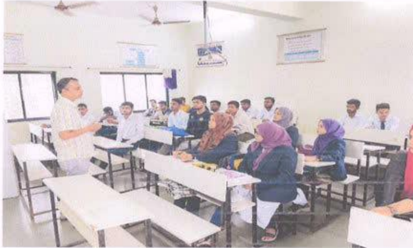
Participants Student in Student Exchange activity.

Briefing Activity – Student from Shrimati Indira Mahadev Beharey College of arts, Shriman Chandulal Sheth College of commerce & Shrimati Shobhanatai Chandulal Sheth College of Science, khed. dist.- Ratnagiri, Maharashtra. Were attended lecture at T.B.K. Arts, Comm. And Science college Bharana, Tq. Khed. Dist.- Ratnagiri. on Date- 8/10/2022. The attended lecture on organized by the college