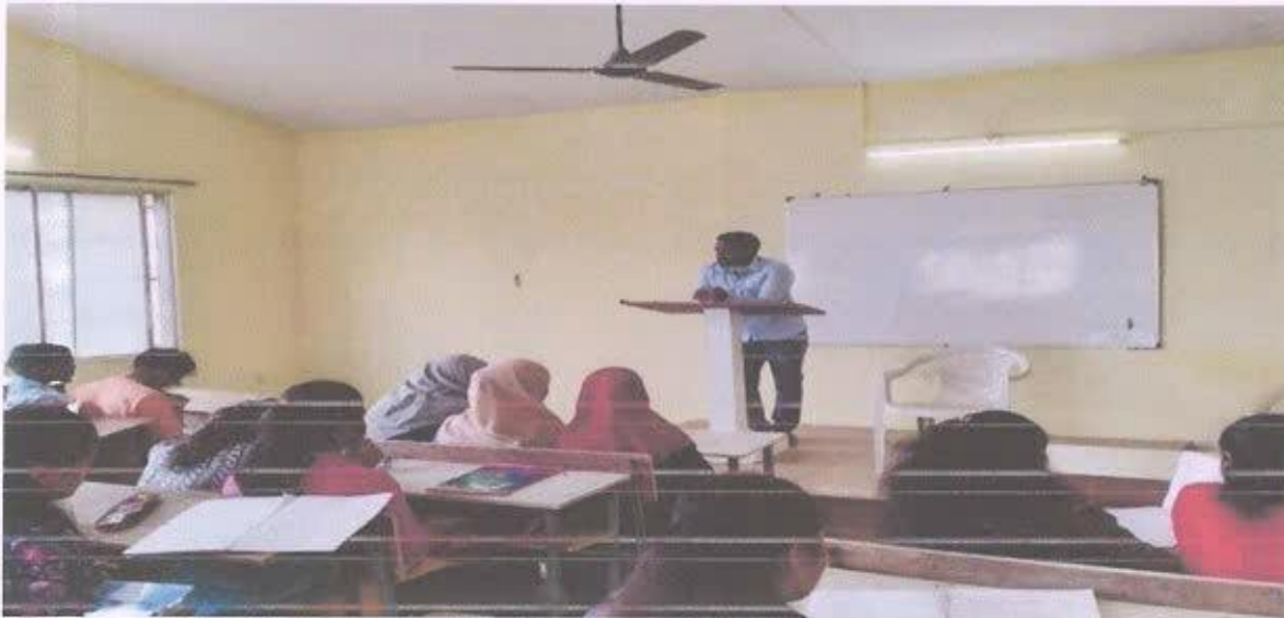
Students are attending the lecture

Briefing Activity- In student exchange activity, student from Shrimati Indira Mahadev Beharey College of arts, Shriman Chandulal Sheth College of Commerce & Shrimati Shobhanatai Chandulal Sheth College of Science, khed. Dist. Ratnagiri, Maharashtra were attended the lecture in Shri Bhausahab vartak kala, Vanijya, Vidnyan Mahavidyalaya and sheth kanhaji V. Parekh kala ani Vanijya kanishh Mahavidyalaya. Boriwali.