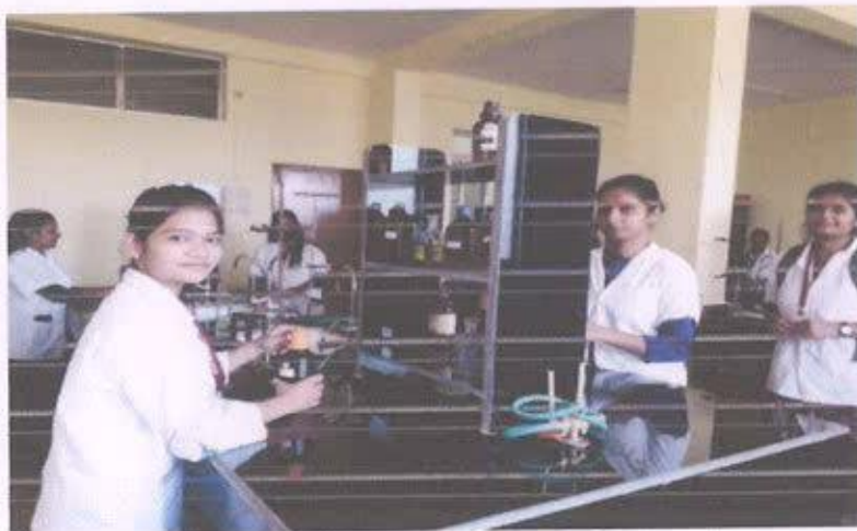
Lab. work under student exchange activity.

Briefing Activity - student from Shrimati Indira Mahadev Beharey College of arts, Shriman Chandulal Sheth College of commerce & Shrimati Shobhanatai Chandulal Sheth College of Science khed. Dist. Ratnagiri, Maharashtra were attended a laboratory work in Dnyandeep College of Science and Commerce, Khed. Dist. - Ratnagiri for new technique and method of green synthesis to minimize the pollution caused by the chemical reaction.