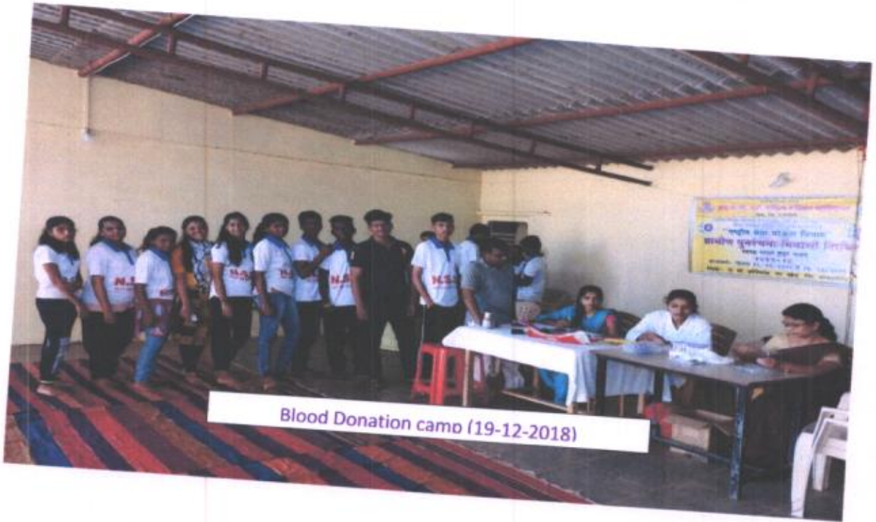
Blood Donation camp (19-12-2018)