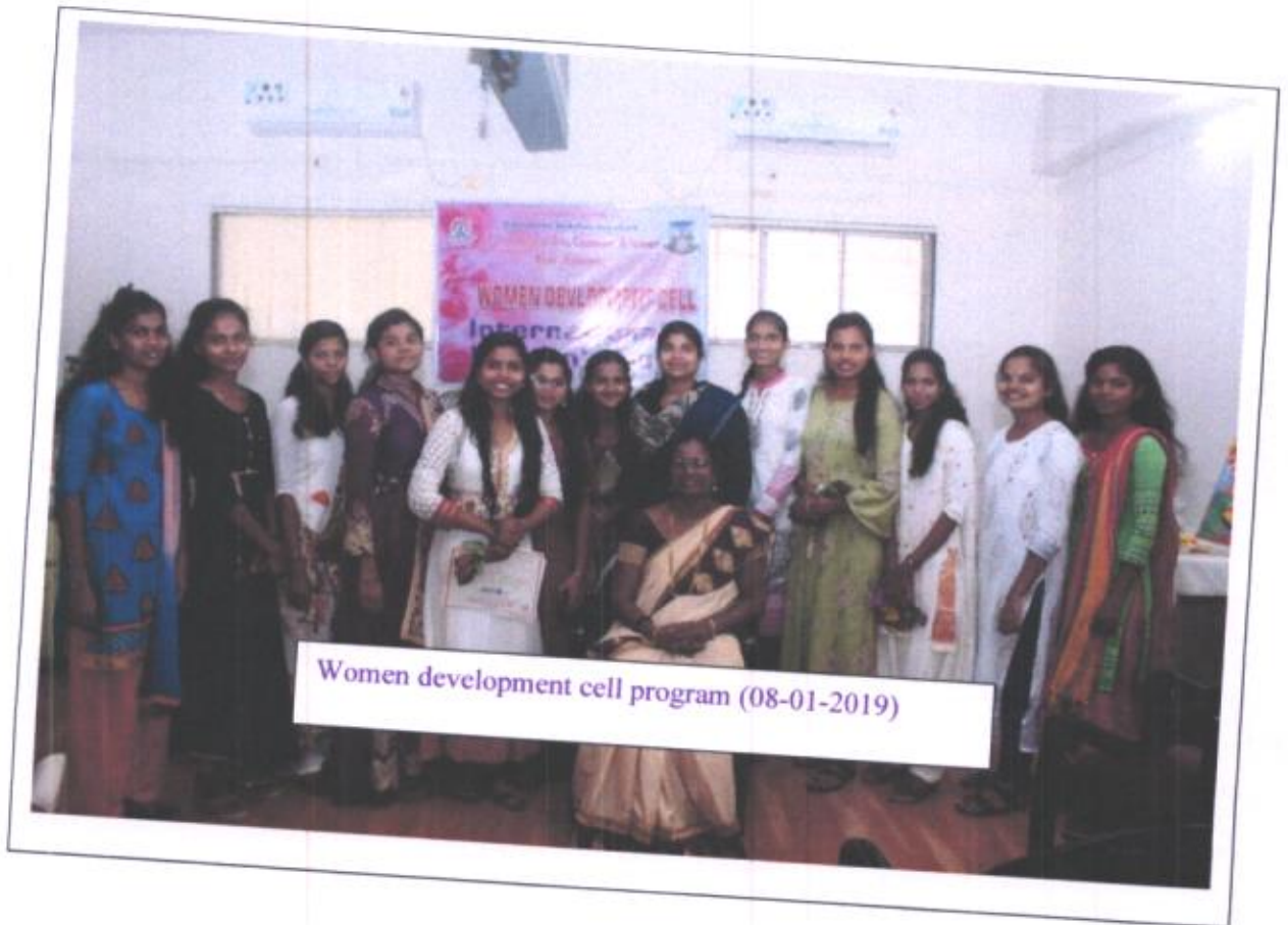
Women development cell program (08-01-2019)