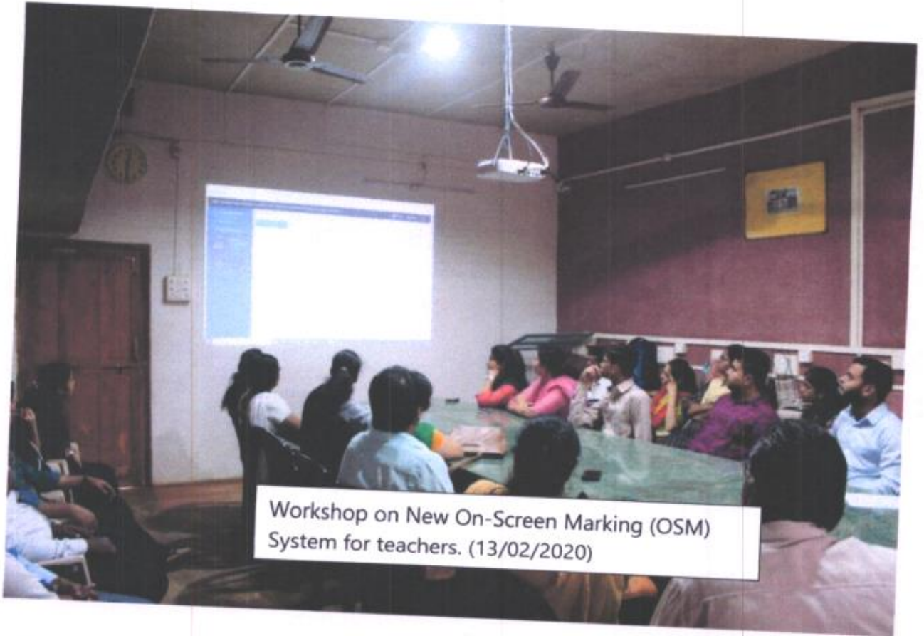
Workshop on New On-Screen Marking (OSM) System for teachers. (13/02/2020)