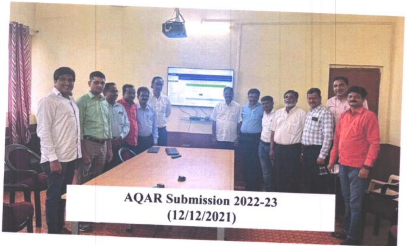
AQAR Submission 2022-23 (12/12/2021)