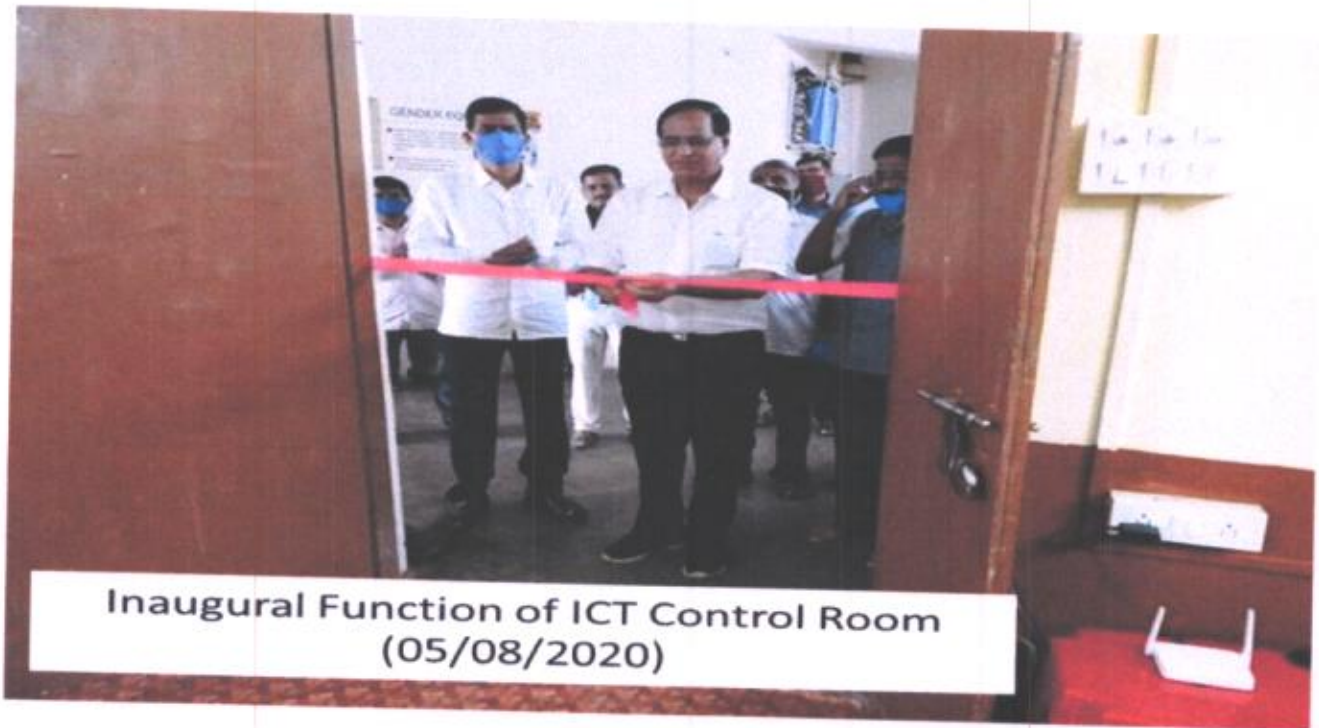
Inaugural Function of ICT Control Room (05/08/2020)