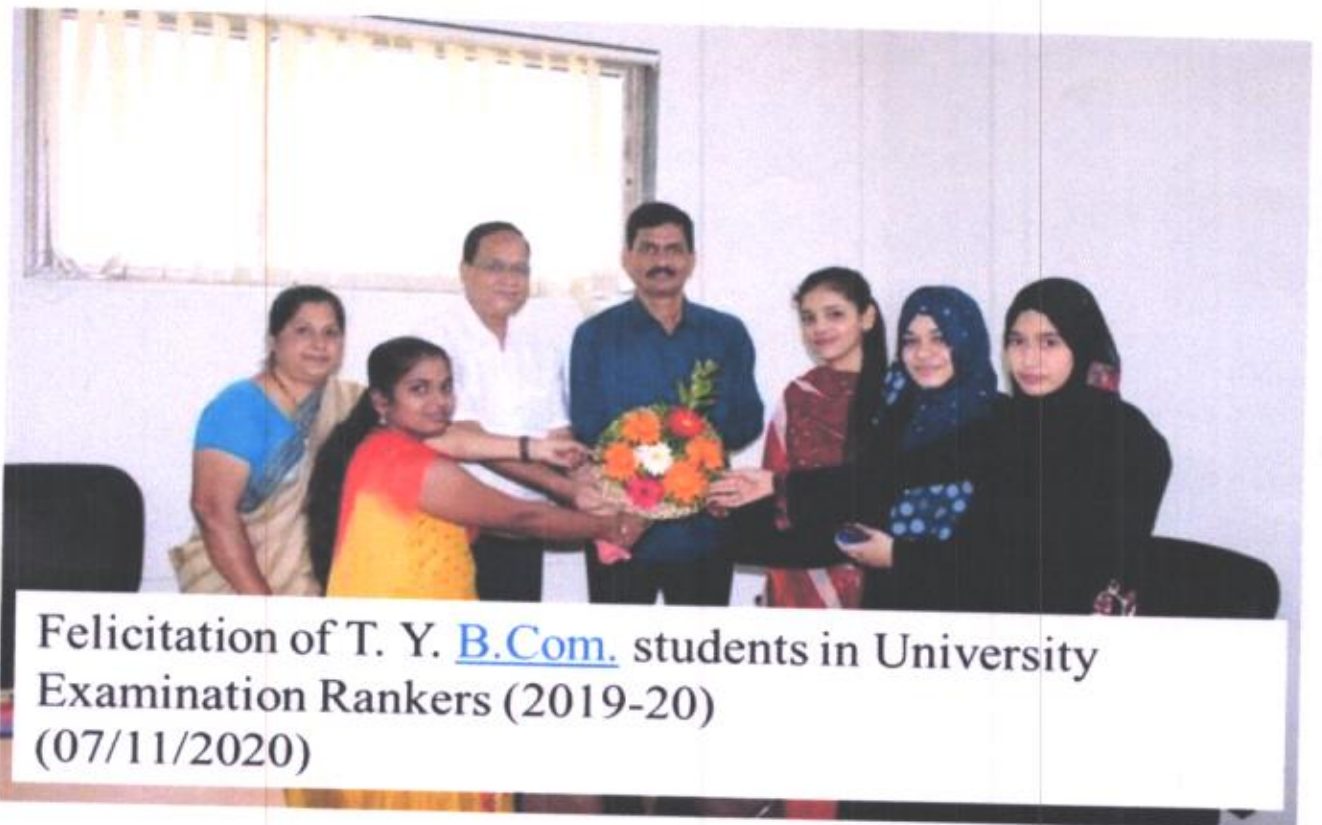
Felicitation of T. Y. B.Com. students in University Examination Rankers (2019-20) (07/11/2020)