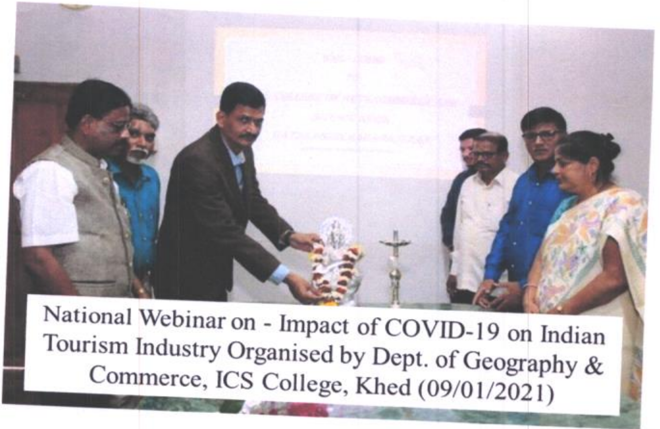
National Webinar on - Impact of COVID-19 on Indian Tourism Industry Organised by Dept. of Geography & Commerce, ICS College, Khed (09/01/2021)