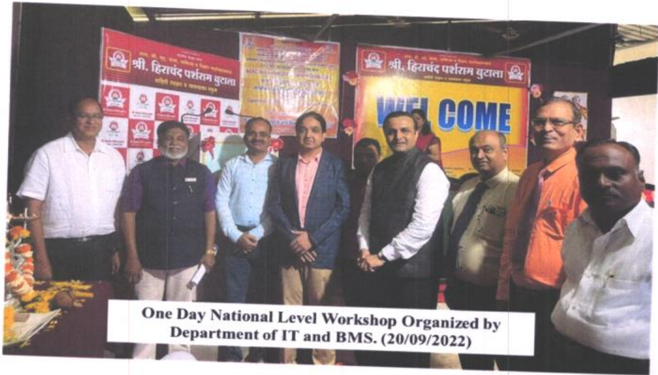
One Day National Level Workshop Organized by Department of IT and BMS. (20/09/2022)