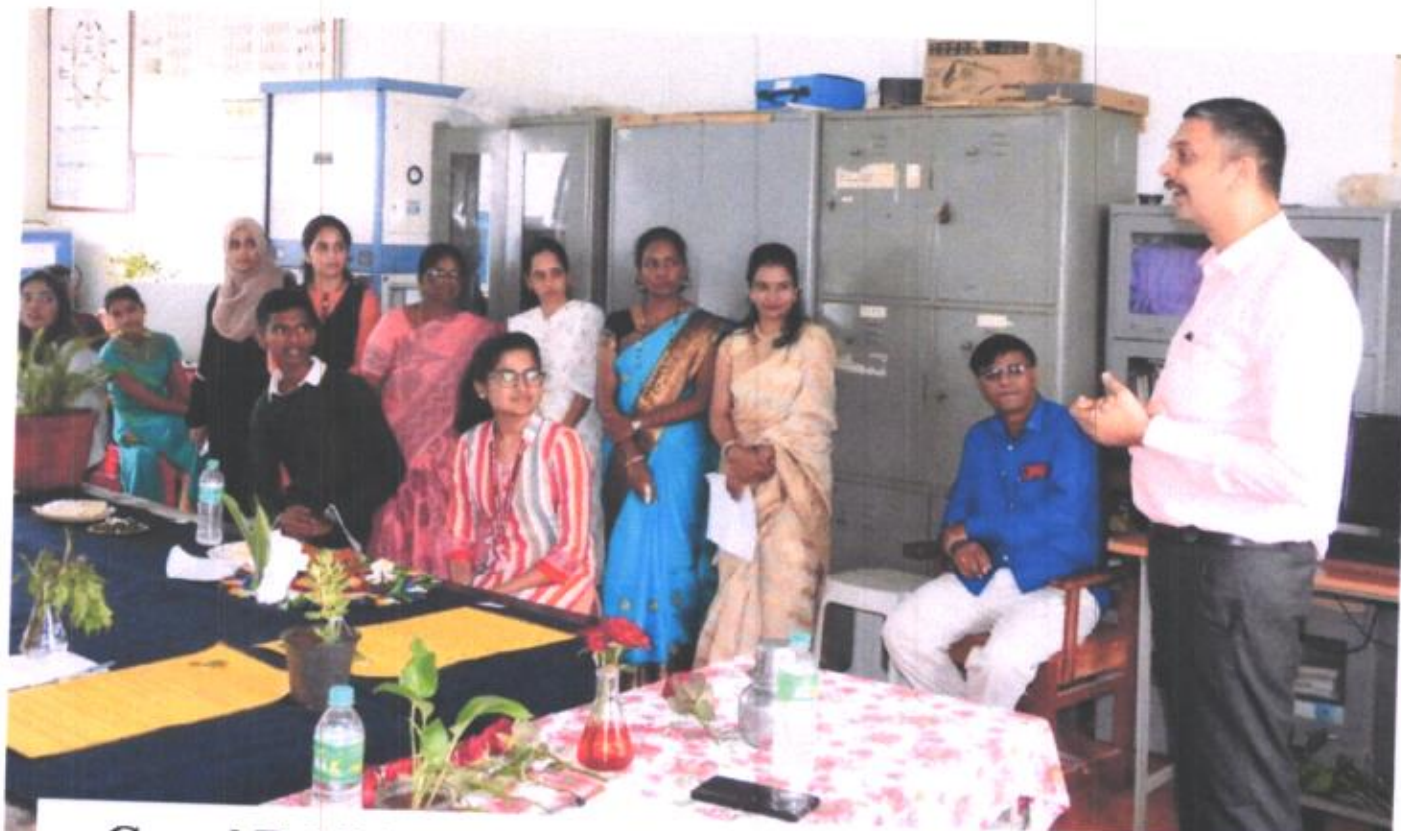
Grand Exhibition Of Wild Vegetables And Cuisine At ICS College, Khed (24/08/2022)

In conclusion, the year 2022-23 has been marked by significant progress and commitment to quality education and overall development at the College. Through workshops, activities, and feedback-driven improvements, we have strived to enhance the learning experience. Our focus on ICT-based teaching, collaboration through MoUs, and the AAA report's recommendations reflect our dedication to academic excellence. We extend our gratitude to all stakeholders for their support, and we eagerly anticipate another year of growth, learning, and achievement. The college remains committed to its mission of providing a conducive learning environment and preparing students to excel in their chosen fields.